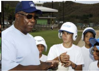
Hank Aaron with kids at WCBF 2007